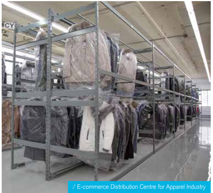
/ E-commerce Distribution Centre for Apparel Industry