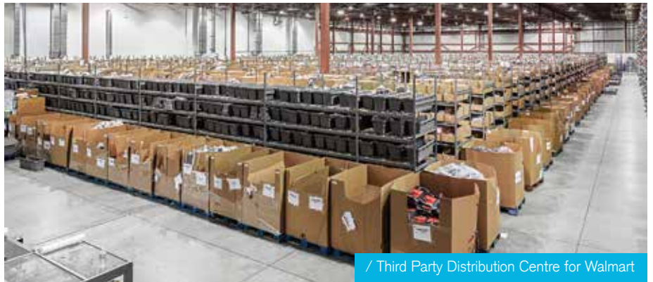
/ Third Party Distribution Centre for Walmart