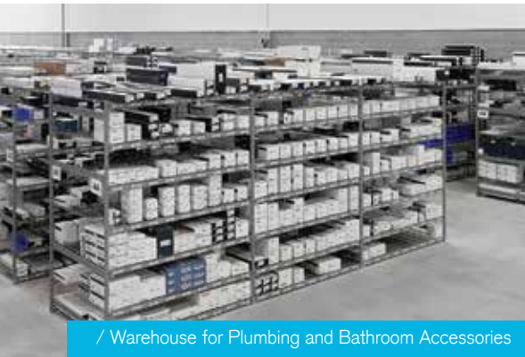
/ Warehouse for Plumbing and Bathroom Accessories