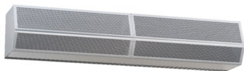
EP2 (Extra Power)