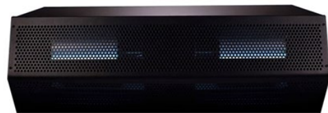
Clean Air (UVC)