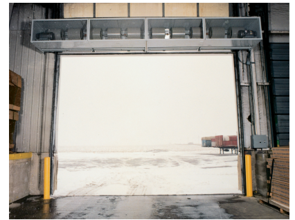
Application Images: Above - Distribution Warehouse Floor Plan; Top Right - Cold Storage; Bottom Right - Dock Door